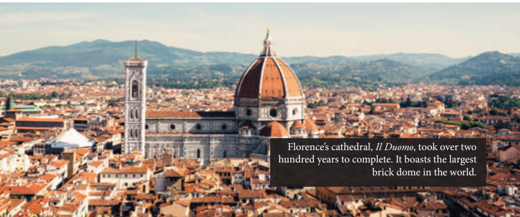
Florence’s cathedral, Il Duomo , took over two hundred years to complete. It boasts the largest brick dome in the world.

Jesus not only agreed that the architectural gathering space(s) of the temple (and related synagogues) were sacred, He became passionately angered by its misuse, crying the words of Isaiah 56:7: