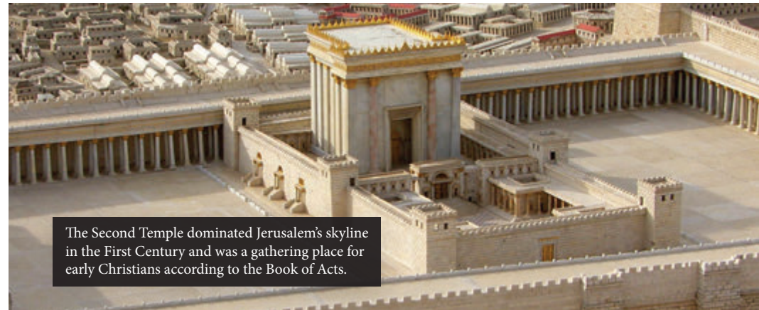
The Second Temple dominated Jerusalem's skyline in the First Century and was a gathering place for early Christians according to the Book of Acts.

While it is certainly true that an individual can and should worship God at home (or anywhere for that matter), a beautiful corporate worship space was not our idea. Rather, it is required by God according to the Bible. The New Testament should not be viewed as a replacement of the Old Testament. Instead it is to be viewed as a fresh extension of what Father God was already doing in the earth before Christ, His Son, arrived.